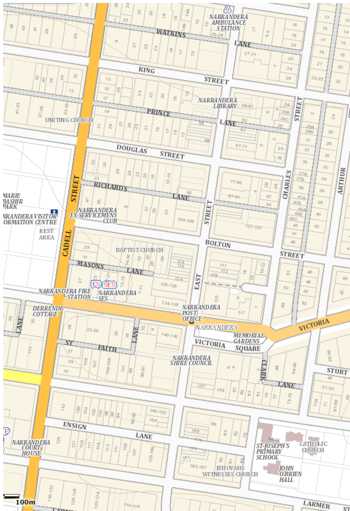
Image 1 - Narrandera