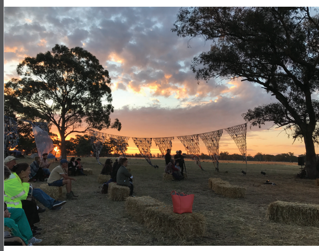
Image: Cad Factory - Shadow Places – Narrandera Travelling Stock Route.

As a planning framework the document provides strategic directions for Council in response to the priorities identified by the Shire's residents during the consultation process. The Plan will assist Council to fulfil its role as a cultural leader, supporting the Shire's Arts and Cultural development, working with organisations and artists, and strengthening the Shire's cultural life.