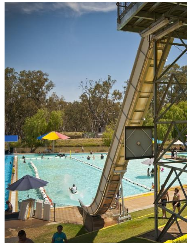
Waterslide at the Lake Talbot Aquatic Centre.