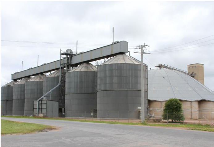
Narrandera Shire is a significant grain producer