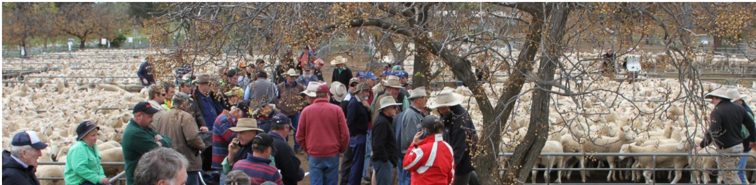
Sheep sale, Narrandera Sale Yards