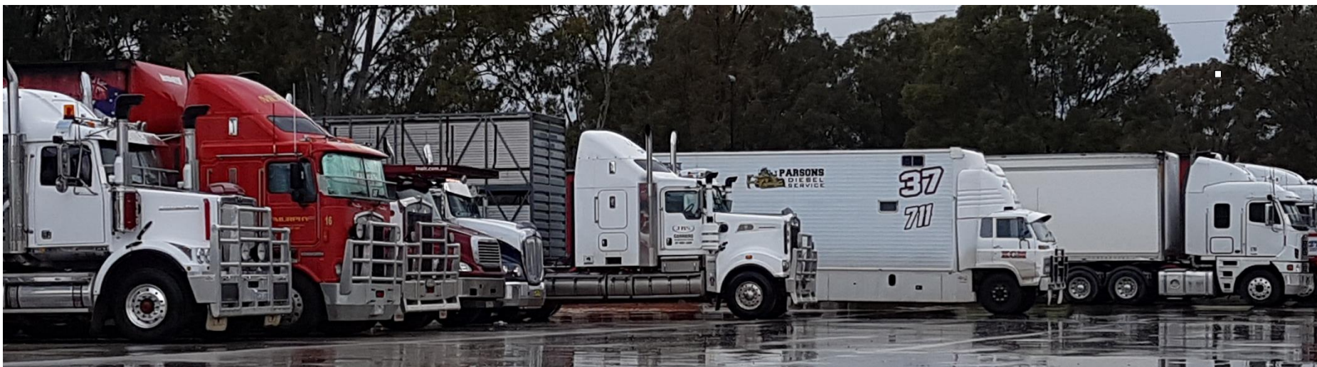
Located on the intersection of the Newell and Sturt Highways, the Service Centre at Gillenbah is a very popular rest stop for trucks.

Narrandera has a commercial airport with Regional Express (REX) Airlines operating daily services between Narrandera – Griffith and Sydney. Flights to Melbourne are available from Wagga Wagga.