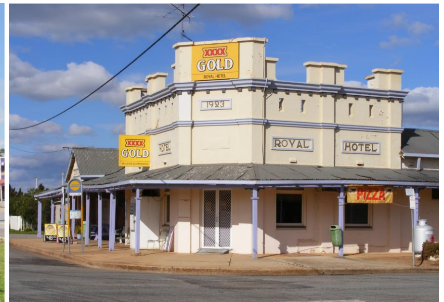
Left: Barellan's main attraction – the big tennis racquet Above: Royal Hotel Grong Grong