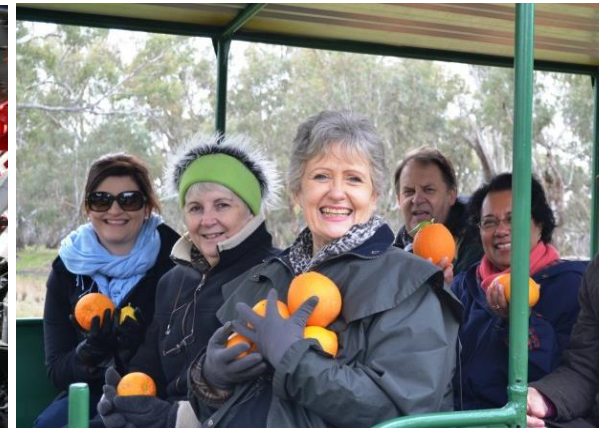
From Left to Right: King Bee Honey ( www.weeklytimes.com ), Riverina Agricultural Tours ( www.insideriverina.com ), Glendale Orchard Tours ( www.narrandera.com.au )