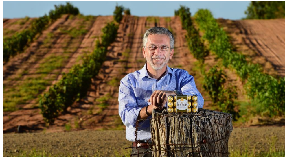
Top: Hutchin Bros Engineering