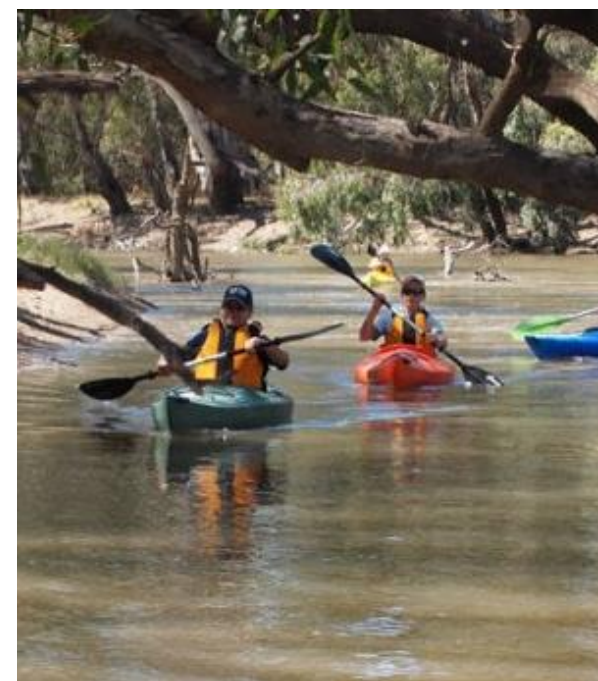
Canoeing on the Murrumbidgee River at Narrandera