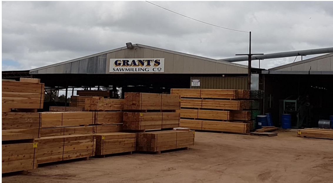
Grants Sawmilling Co

Council will create a positive investment environment